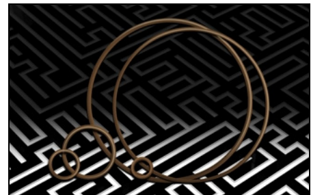
Kalrez® 9300 parts are based on a proprietary crosslinking and mechanical reinforcement system developed by DuPont.

Kalrez® 9300 exhibits excellent resistance to oxygen and fluorine-based plasma and etch process chemistry. It also offers very low metals content, excellent thermal stability and mechanical strength, and is well suited for both static and dynamic sealing applications. A maximum continuous service temperature of 300°C is suggested. Ultrapure post-cleaning and packaging is standard for all Kalrez® 9300 parts.