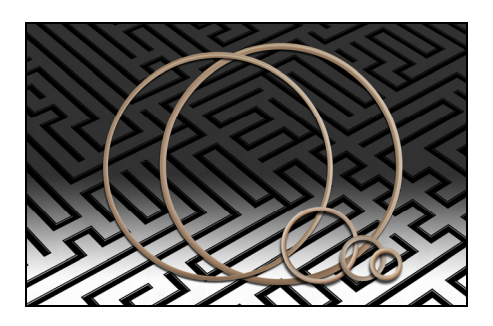
Kalrez® 9500 parts are based on a proprietary crosslinking system developed by DuPont.

Kalrez® 9500 exhibits excellent resistance to CVD and ash/strip process chemistry, i.e., ozone, ammonia and water vapor. It also offers outstanding thermal stability, very low outgassing and excellent mechanical strength and is well suited for both static and dynamic sealing applications. A maximum continuous service temperature of 310 °C is suggested. Kalrez® 9500 can also withstand short-term excursions up to 325 °C. Ultrapure post-cleaning and packaging is standard for all Kalrez® 9500 parts.